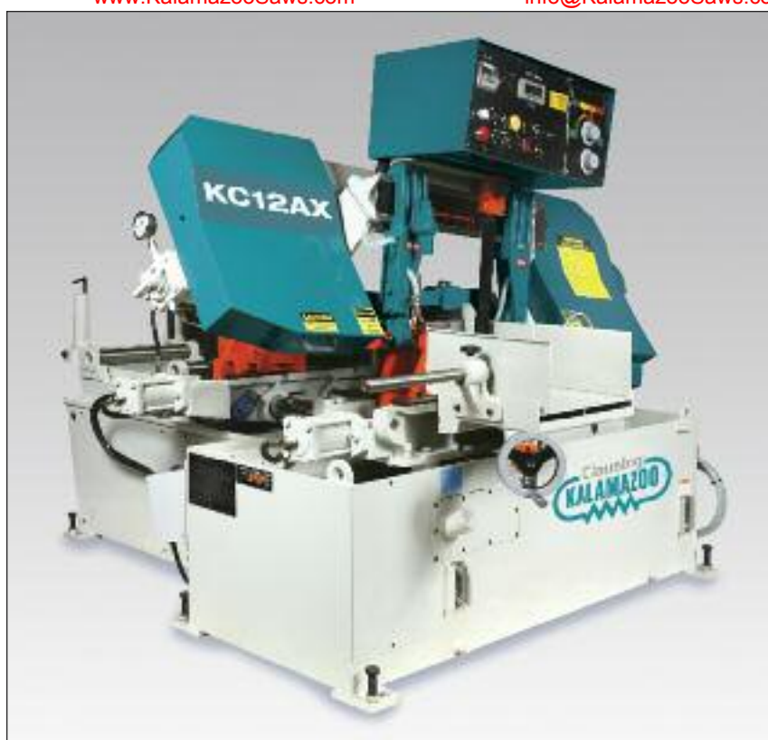
Shown with optional Hydraulic Bundle Clamp and Variable Vise Pressure System