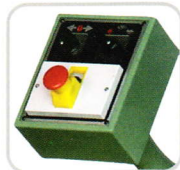
CP30R Convenient Extended Controls